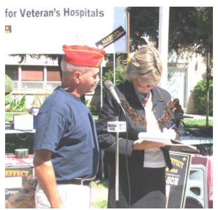
Acting Governor Denish signs OFFE resolution to mandate full funding of the VA.

The brief signing ceremony was also broadcast live over Stardust Radio, which has a large number of listeners among our deployed troops and military families.