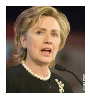
Presidential Candidate Hillary Clinton

New York Senator Hillary Rodham Clinton (D), is the first 2008 presidential candidate to sign Operation Firing For Effect's Resolution calling for full mandatory funding of veteran's healthcare. http://offe2008.org/RESOLUTIONS/Clinton.pdf